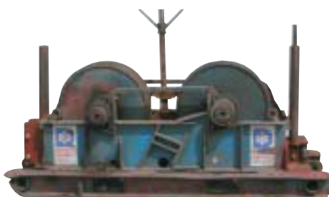
\frac{3}{16} - \frac{5}{8}